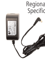
A/C Power Adapter

The Optimum M4230 GSM/GPRS Terminal Installation Guide provides basic setup information. Your device also comes pre-installed with a Lithium Ion Battery Module (7.4V - 1.88Ah). Once fully charged, the battery can complete more than 200 transactions before requiring another charge.