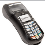
Optimum M4230 (P/N# 010341-002R For EMEA & Asia Region)