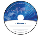
Optimum Developer's Toolkit (P/N# 010305-xxx)