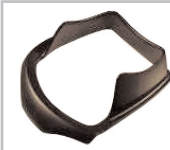
Privacy Shield (P/N# 040348-001)