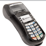
Optimum M4230 (P/N# 010341-007R For North America Region)