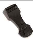
Docking Station (P/N# VE018-2007)