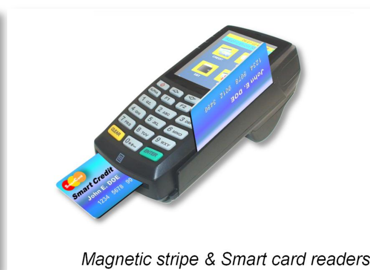
Magnetic stripe & Smart card readers