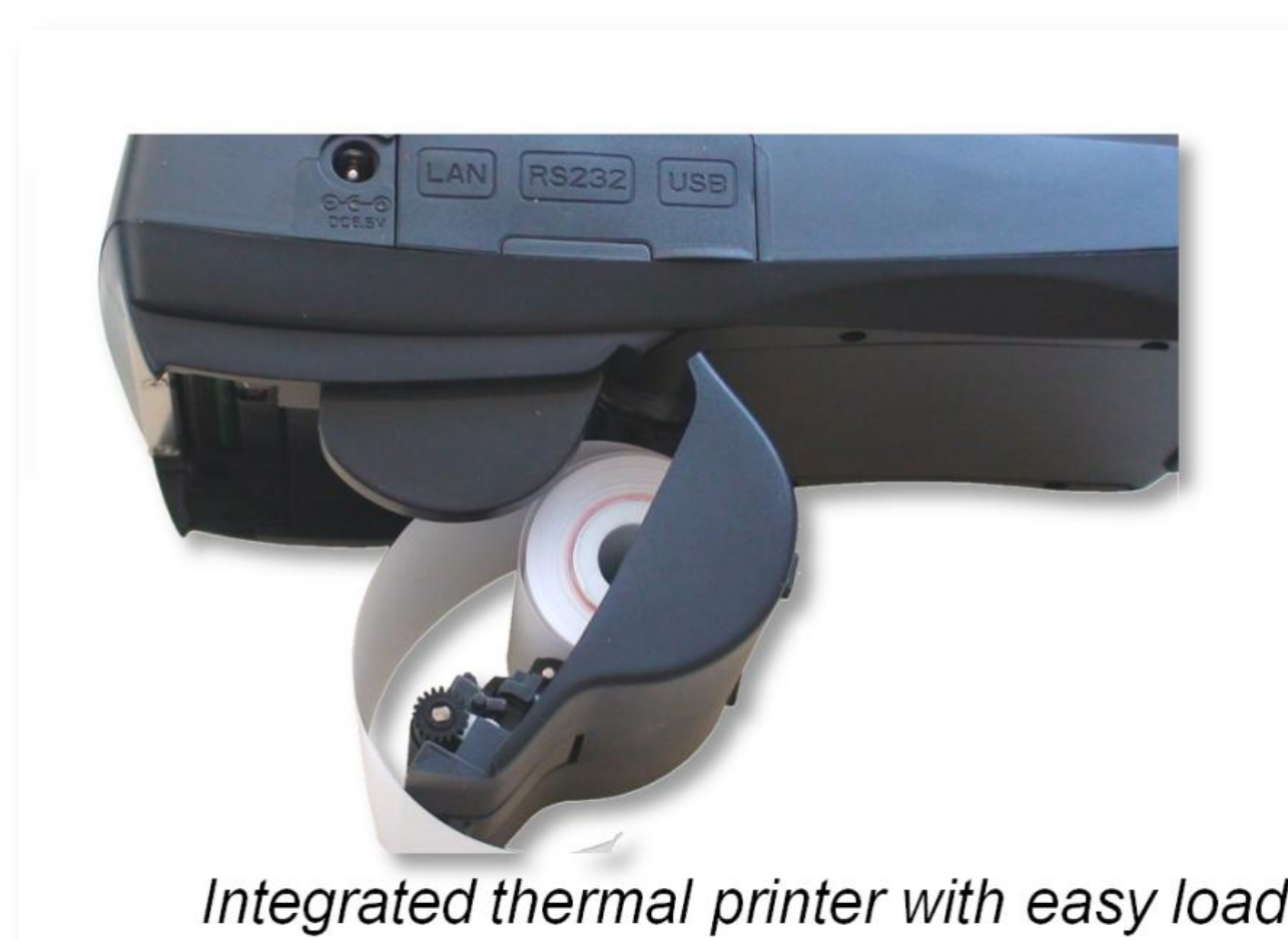
Integrated thermal printer with easy load